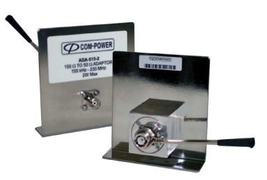
ADA-515-2 Adapter Set